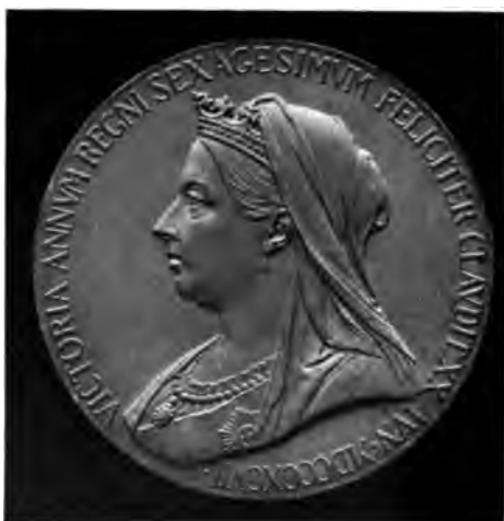
MEDAL COMMEMORATIVE OF QUEEN VICTORIA'S DIAMOND JUBILEE OF 1897